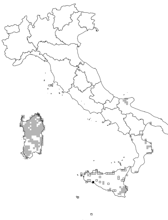
Figure 15. Distribution in Italy of the Habitat 9320: in black the new cell, in grey the cells officially reported in the 4th Habitat report ex-Art. 17 (period 2013–2018; Eionet 2019), in white (black outline) the cells later reported by Gianguzzi et al. (2020) and Bazan et al. (2021).