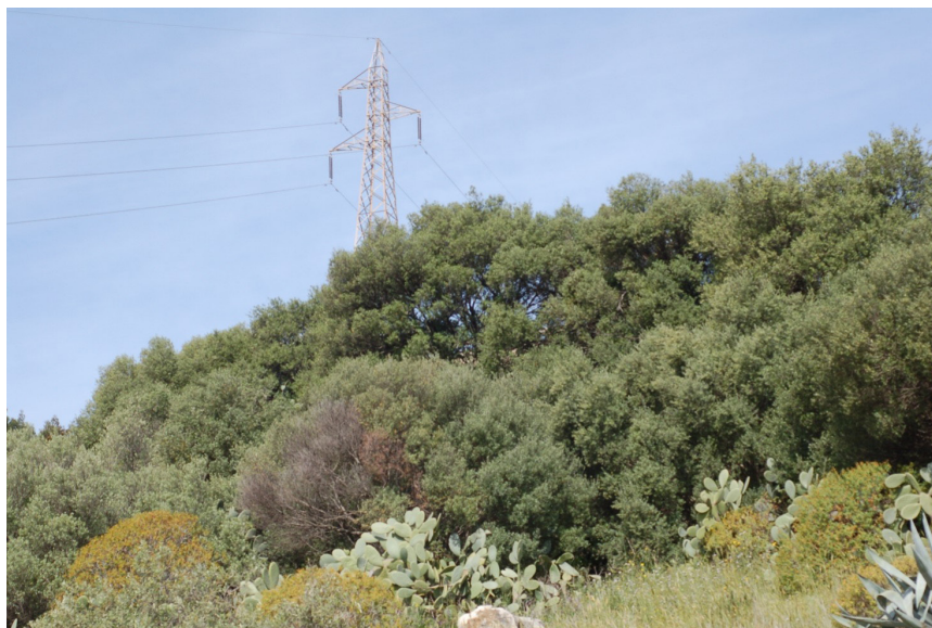
Figure 16. Habitat 9320, Olea europaea L. var. sylvestris formation at Monte San Calogero (Sciacca, SW-Sicily, Italy).

^ Reference plant species of the Habitat 9320, from Biondi et al. (2009).