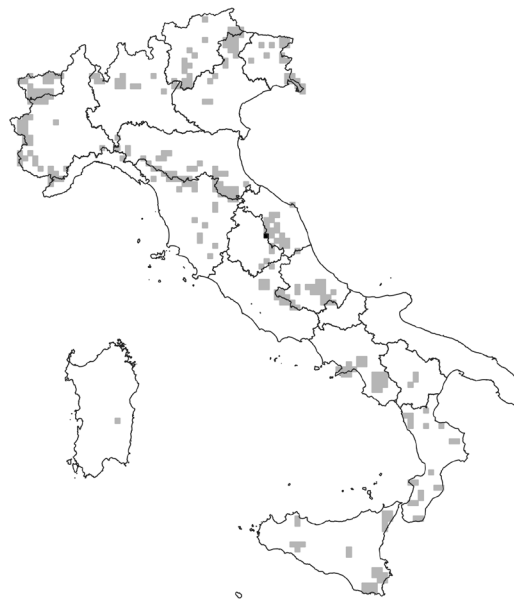
Figure 11. Distribution in Italy of the Habitat 7140: in black the new cell, in grey the cells officially reported in the 4th Habitat report ex-Art. 17 (period 2013–2018; Eionet 2019).

^ Reference plant species of the Habitat 6410, from Biondi et al. (2009).