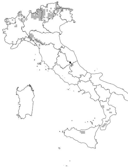
Figure 10. Distribution in Italy of the Habitat 6410: in black the new cell, in grey the cells officially reported in the 4th Habitat report ex-Art. 17 (period 2013–2018; Eionet 2019).

Notes: Two residual monospecific populations of Sphagnum , probably relict of the late glacial period (Brugiapaglia 2007), are found in wet karst sink-hole environment, in the Sibillini Mountains (Central Italy) at an altitudinal range from 1274 m a.s.l. on Pian Grande, to 1332 m a.s.l. on Pian Piccolo (Aleffi and Cortini Pedrotti 1998). Here, they represent the southern limit of the peat-bog vegetation of the continental and boreo-alpine European vegetation, and therefore have a great value from a biogeographical point of view. Since this Habitat is located outside its optimum range, it shows a strong impoverishment of the floristic composition and a loss in characteristic/diagnostic species: in fact, it is represented here by small and fragmented plant communities, allowing only a weak formal syntaxonomic classification.