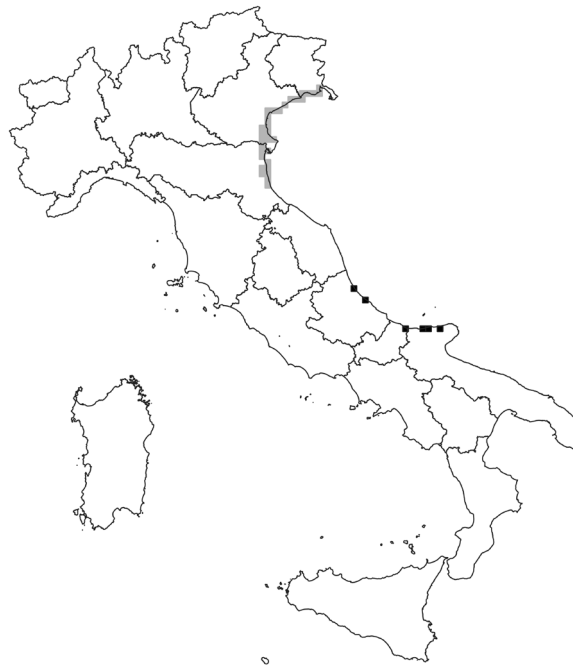
Figure 2. Distribution in Italy of the Habitat 2130*: in black the new cell, in grey the cells officially reported in the 4th Habitat report ex-Art. 17 (period 2013-2018; Eionet 2019).