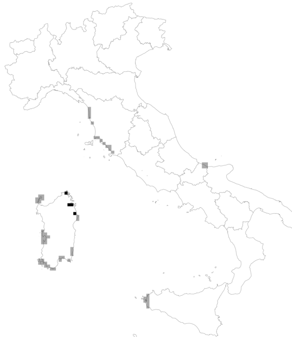
Figure 1. Distribution in Italy of the Habitat 1510*: in black the new cell, in grey the cells officially reported in the 4th Habitat report ex-Art. 17 (period 2013–2018; Eionet 2019).

Geographic information: unpublished relevés: #27a: Italy, Abruzzo, Teramo, Torre del Cerrano, 0 m a.s.l., Coordinates: 42.59306 N, 14.08217 E (Tab. 3, Rel. 1); 1 m a.s.l., Coordinates: 42.59104 N, 14.0839 E (Tab. 3, Rel. 2); 1 m a.s.l., Coordinates: 42.58943 N, 14.08512 E (Tab. 3, Rel. 3); Italy, Abruzzo, Chieti, Foro, 2 m a.s.l., Coordinates: 42.39233 N, 14.34526 E (Tab. 3, Rel. 4); #27b: Italy, Molise,