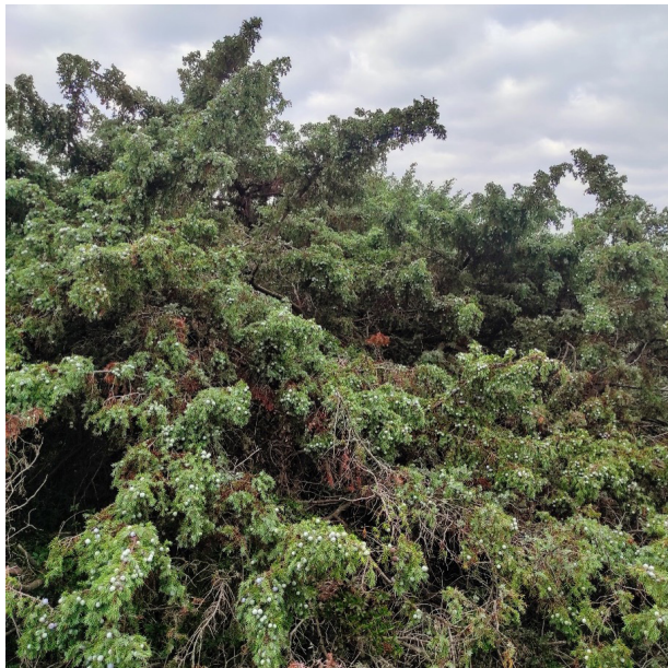
Figure 4. Habitat 2250* in the Regional Natural Park “Costa Ripagnola” (Apulia).

^ Reference plant species of the Habitat 2250*, from Biondi et al. (2009).