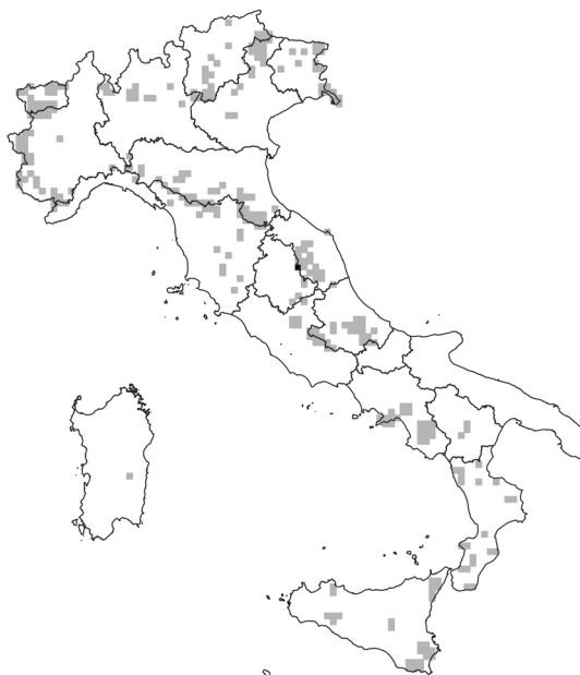
Figure 12. Distribution in Italy of the Habitat 7220*: in black the new cell, in grey the cells officially reported in the 4th Habitat report ex-Art. 17 (period 2013-2018; Eionet 2019).