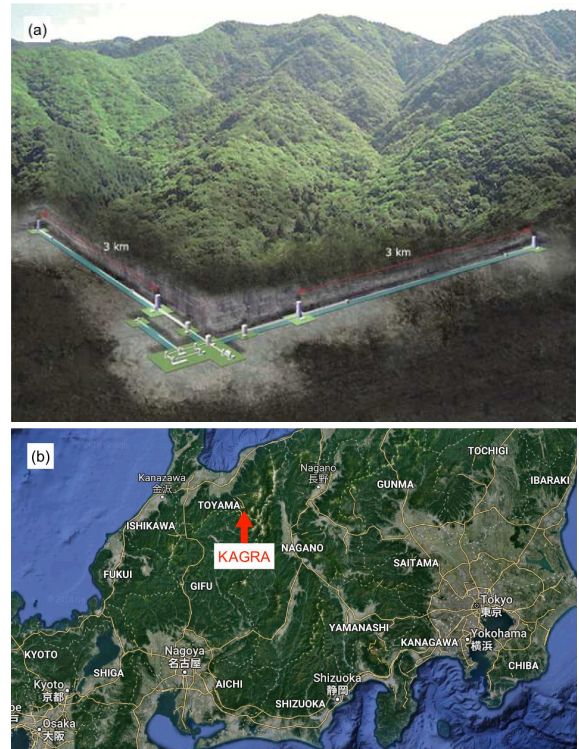
Figure 1: LOCATION OF KAGRA. (a) Concept image of KAGRA: a 3-km cryogenic interferometer inside Ikenoyama mountain. (b) KAGRA is located in Kamioka, Gifu, Japan, which is located 220 km northwest of Tokyo.

The latest event GW170817 [6], was the long-sought event of binary neutron star (NS) merger. The distance and location of GW170817 was narrowed down to 40 \pm 8 Mpc and about 30 \text{ deg}^2 in the sky by the LIGO-Virgo observation, allowing astronomers to identify electromagnetic counterparts and the host Galaxy (NGC 4993) [13]. Furthermore, afterglows from the merger remnants and later outcomes via various baryonic interactions were observed by the telescopes on the Earth as well as space satellites from radio to \gamma -rays.