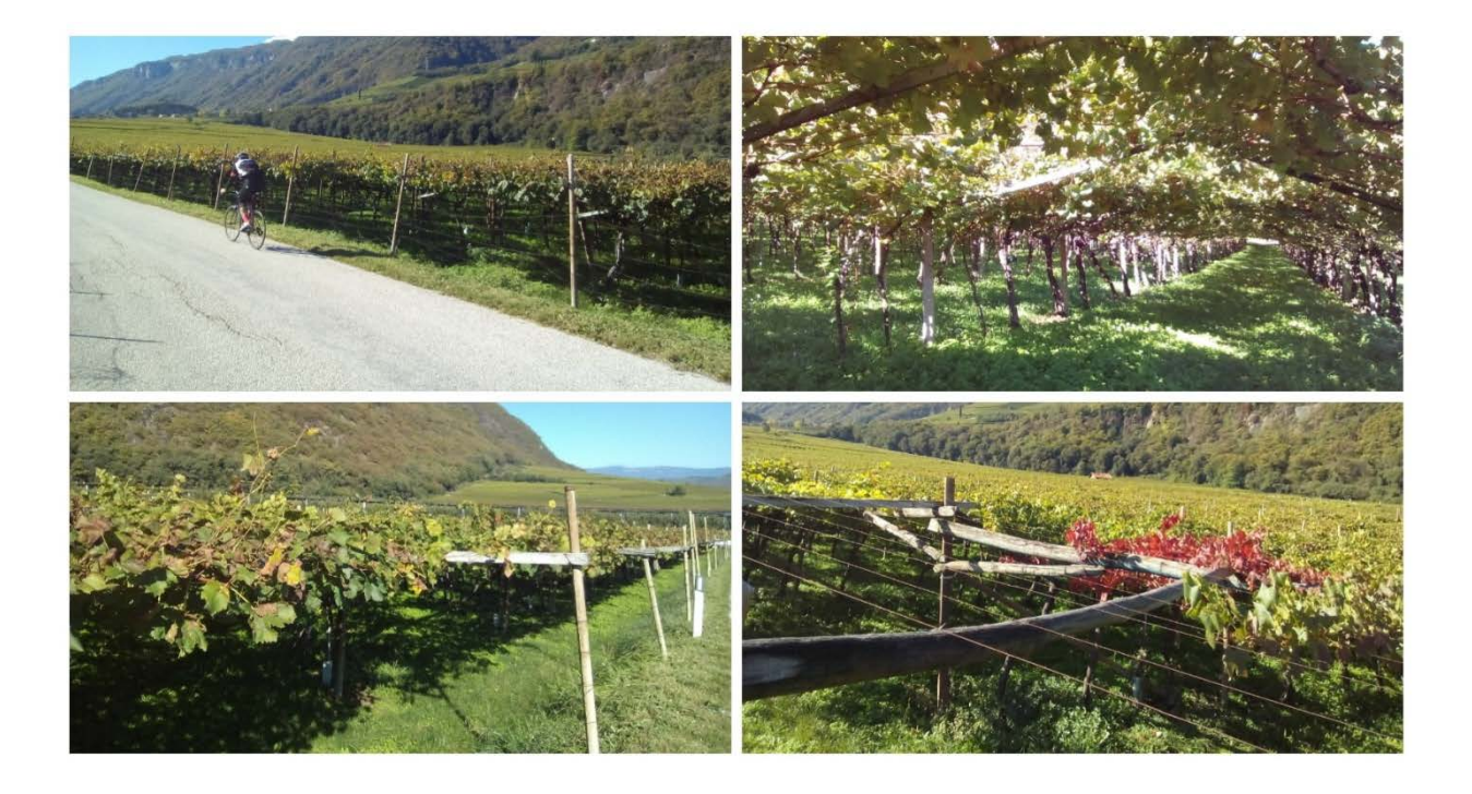
Figure 1. Wine Landscapes in North East of Italy.

strategies for territory management [27], with the consensus of the local population, towards a shared well-being (Figure 1).