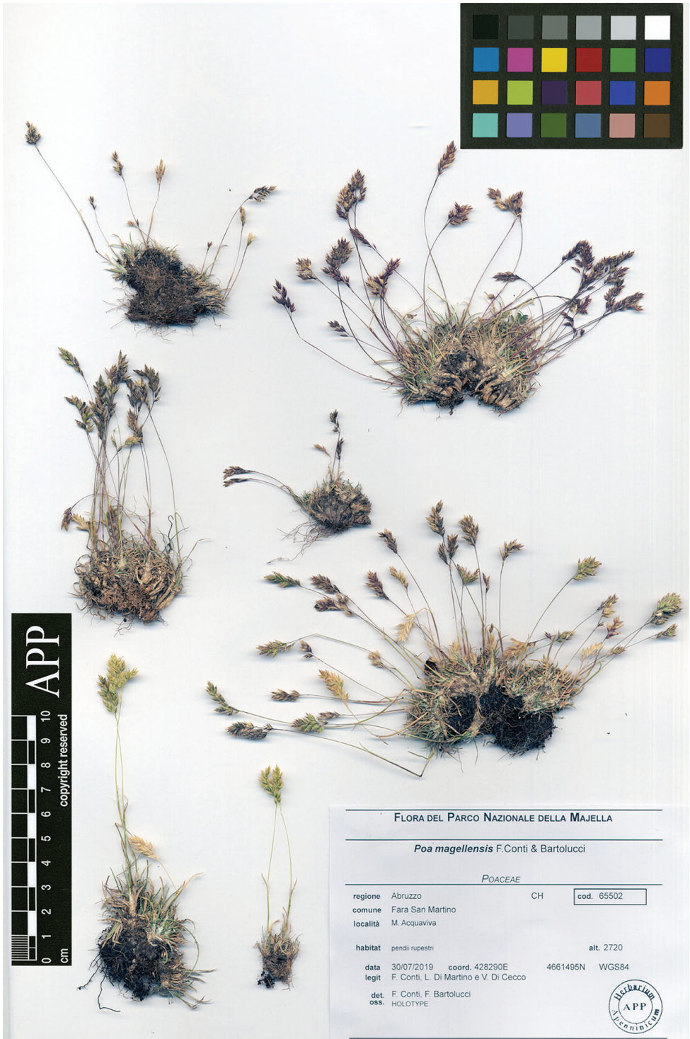
Figure 3. Holotype of Poa magellensis F.Conti & Bartolucci (APP, reproduced with permission of the Herbarium, Centro Ricerche Floristiche dell'Appennino, Italy).