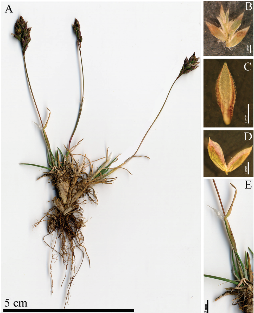
Figure 2. Poa magellensis F.Conti & Bartolucci, sp. nov. A habit B spikelet without glumes C palea D glumes E ligules.

terete, smooth, glabrous, ribbed; collars smooth, glabrous; blades of basal leaves (8)8.6–19.4(20) mm long, 0.8–1.5(1.6) mm wide, linear, usually folded, abaxially rough, margins lightly scabrous, adaxially lightly scabrous or sparsely hairy, prow-tipped, blades strongly graduated or reduced distally, blades of uppermost leaves 3.5–12 mm long, ligules of the basal leaves (4)4.7–10.2(12) mm long, smooth, glabrous, whitish-pearly, lacerate, apices acuminate, decurrent on the sheaths; ligules of the uppermost leaves