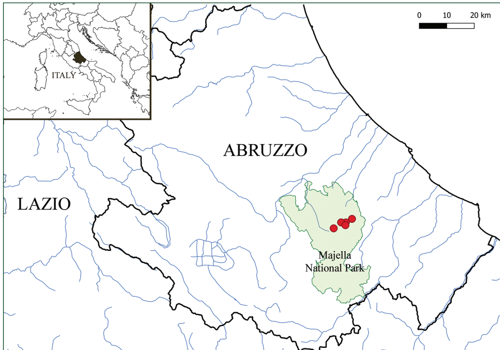
Figure 4. Map showing distribution of Poa magellensis F.Conti & Bartolucci, sp. nov. in Central Apennine, Abruzzo (Italy).