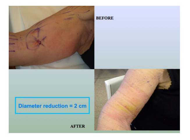
Figure 3 Two-cm reduction in right arm circumference after first treatment with Nd:YAG 1062 nm (15 W) endovenous laser.

used at the skin access site and the arm surface is regularly cooled. Obviously, multiple longitudinal channel drilling cannot be considered a radical management procedure for lymphedema. Because it achieves autonomous active lymphatic drainage, regular daily mechanical or manual pressotherapy is required to keep the channels open and prevent further fibrotic reactions and obstruction of continuous lymph flow into the newly formed lumen. In our experience, it is mandatory to prepare a functional area in the normal dermis cephalad to the lymphedematous tissue in order to distribute the drained lymphatic volume recovered by daily pressotherapy through these short (15–20 cm) newly formed channels. Even if this step may damage the normal lymphatic network in the adjacent area, 12 it is necessary in order to facilitate uptake of fluid into normal lymphatic vessels. In