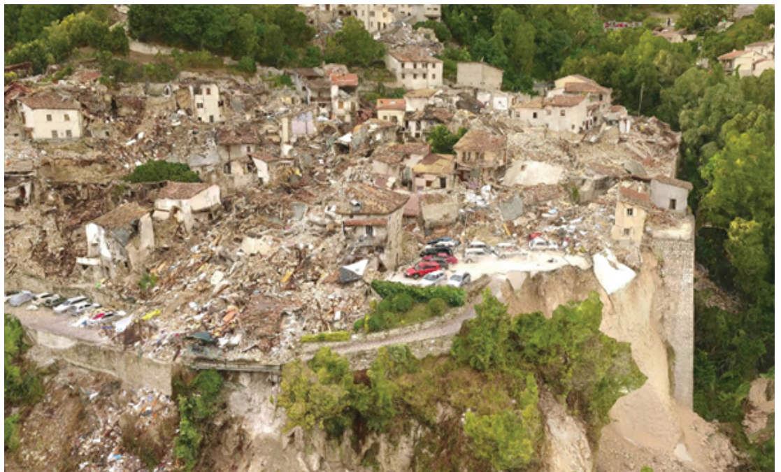
Figure 1: Pescara del Tronto after 2016 earthquake.

materials and systems is reported to bring other significant advantages over traditional construction, including superior quality control through prefabrication, better energy performance and reduced site deliveries, noise and pollution - and thus less disruption to existing communities. The sophistication and range of manufactured systems and components available today – and the opportunities that digital techniques and processes offer - mean that factory-made construction has enormous potential to make a positive contribution to reconstruction housing needs. However, the same level of consideration needs to be given to design, placemaking, amenity, infrastructure and public realm, as it would for any project built using traditional construction methods, to ensure that quality remains at the core of delivering new factory-made homes that will support and sustain local communities for the long term.