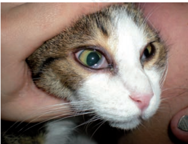
Figure 4. Same eye of Figure 3 after ten days of therapy. Normal eye, mucus discharge still present.