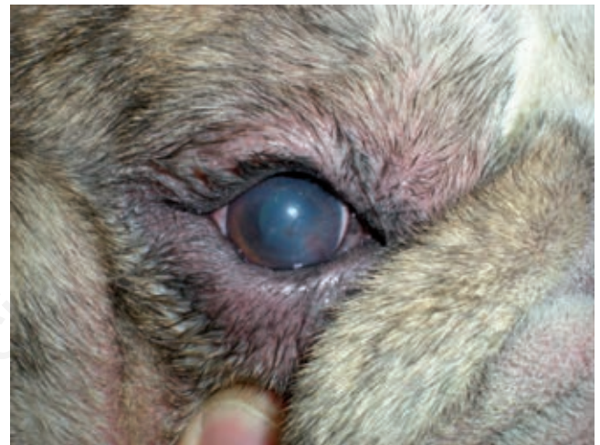
Figure 5. Right eye of 3-years-old English bulldog before starting the treatment. Note entropion, mucous discharge, keratitis, corneal edema, deep and superficial neovascularization.