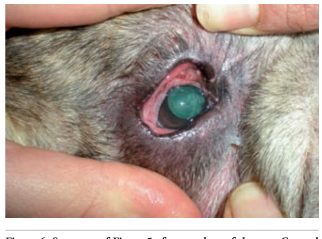
Figure 6. Same eye of Figure 5 after ten days of therapy. Corneal edema has resolved and neovascularization remains only with a single, small caliber vessel arising from limbus at the level of medial cantus. Entropion and mucous discharge are still present.