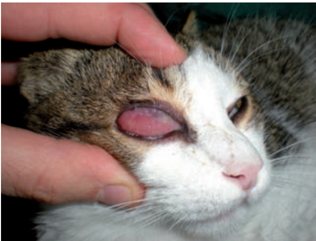
Figure 3. Right eye of 6-months-old cat before starting the treatment. Note marked conjunctival edema, reddening of the conjunctiva and mucous discharge.

In cases as the present one, where surgery cannot be quickly performed, ozone-based eye drops were able to reduce discomfort of the dog and improve corneal health, despite the persistence of underlying cause (mechanical clutch of the hairs of the lids on the cornea).