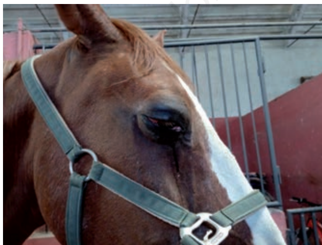
Figure 1. Right eye of 26-year-old horse before starting the treatment. Note blepharitis and blepharospasmus, edematous and hyperemic conjunctiva, plenty mucous ocular discharge.

A 6-month-old male European short hair cat (Figure 3) was affected by chronic conjunctivitis present from birth, unresponsive to the traditional antimicrobial and anti-inflammatory therapy. The day of presentation the patient showed marked conjunctival edema, especially in right eye, reddening of the conjunctiva and mucous discharge on both eyes. Conjunctival bacteriological swabs revealed normal bacteria count in right eye (20 cfu) and the presence of Sthapilococcus spp. and Enterococcus spp. ; in left eye