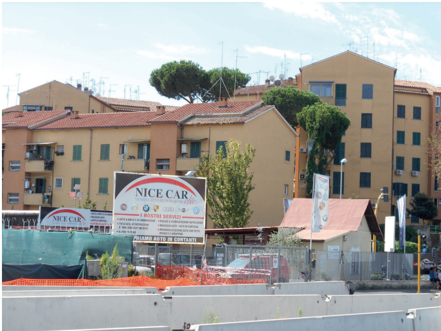
Figure 5.2 The Rebibbia’s surrounding area: historical residential buildings and areas undergoing transformation. Reproduced with permission; no reuse without rightsholder permission.

With specific regard to the prison, the plan is limited to classifying it as an “urban-level public service” without addressing the relationship with the surrounding urban environment, which is where the expected interventions within the fabrics of the consolidated and restoration cities are focused. Particular emphasis is placed on interventions to renovate the existing settlements. The Aguzzano Park becomes a unique part of the system of protected areas of the Aniene River. It acts like glue between the individual built areas and also responds to inhabitants’ quantitative and qualitative need for green areas. In its role as urban glue, it defines the edges of the prison outside its walls. Public residential building present in the limiting areas of Rebibbia (both historical and not, such as the Fascist-era village of San Basilio and the Tiburtino III settlement) becomes, in some cases, the historical 1800s presence of the so-called “historical city” in the new plan, and provides the cultural memory of the 1800s in the complex programs that should activate the interventions of urban renewal. (fig. 5.2, fig. 5.3)