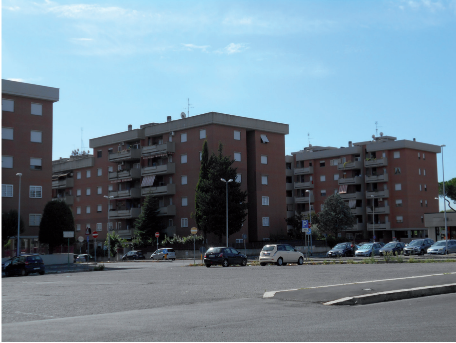
Figure 5.3 The Rebibbia's surrounding area: recent residential buildings. Reproduced with permission; no reuse without rightsholder permission.

If the general regulatory plan is inevitably restricted to defining the prison structure as a public service on the “urban” level, excluding at least apparently a direct dialogue between the prison and the surrounding urban space, the social regulatory plan (SRP) re-establishes this relationship. The SRP represents the uniting design of the urban welfare system, a framework/device for the social policies of the city. It proposes to simultaneously guarantee the global nature of the citizen dimension (the integrated system of services and social interventions in the city of Rome) and the specifics of local needs (the zoning plans of the individual municipalities) in its decentralized, interdependent organizations. In this way, both the metropolitan identity of citizen social policies and the planning and management autonomy of the municipalities are recognized.