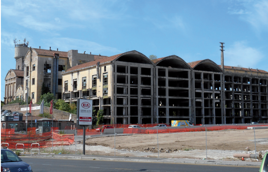
Figure 5.1 The Rebibbia's surrounding area industrial buildings abandoned. Reproduced with permission; no reuse without rightsholder permission.

Perhaps unfortunately, the prison constitutes an “unwanted” centrality in the current structure of the quarter for both its form and its size. Its function certainly relates not to the quarter, but to the urban metropolis, even though its presence characterizes and connotes the entire quarter, both dividing it physically/spatially and uniting it through a series of tertiary activities that go beyond its walls to create a direct connection between inside and outside . The prison represents one of the identities of the neighbourhood, which has now become historical in the urban memory of the city, and not only locally. It is a well-recognized physical identity that contains many other diverse identities, each one carrying personal histories—in many cases unique—that become part of the life of the quarter, even if they apparently remain segregated within the prison walls.