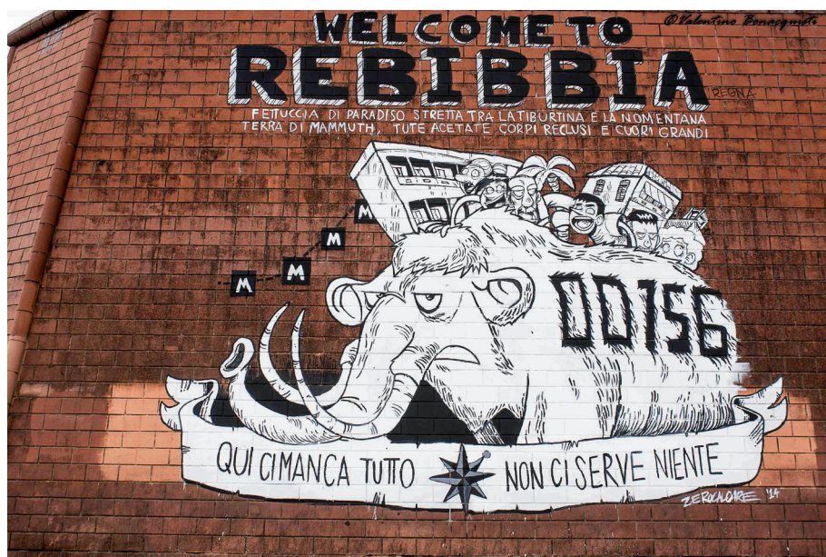
Figure 5.4 The Rebibbia's surrounding murals designed by Zerocalcare. Reproduced with permission; no reuse without rightsholder permission.

The subject of the mural is a mammoth housed at Rebibbia, where Zerocalcare lives. The author often mentions the animal in his cartoons as the other thing that lies in his neighbourhood in addition to the prison. The origins of this motif lie in the archaeological findings in the area of Casal de' Pazzi, where various tusks from the ancient animal were found in the 1980s. For the Roman artist, the mammoth is an element of community pride in contrast to the famous prison. In the mural, a mammoth with the neighbourhood postal code, 00156, carries the artist on its shoulders. The background shows the urban panorama of the quarter, in all its beauty and contradictions. A welcome for those arriving at Rebibbia, the usual phrase "Rebibbia reigns", which is present in all his cartoons, is transformed into a dedication to the neighbourhood, a description that does not overlook the prison: "A narrow stretch of paradise between the Tiburtina and Nomentana. Land of mammoth, acetate coveralls, imprisoned bodies, and big hearts".