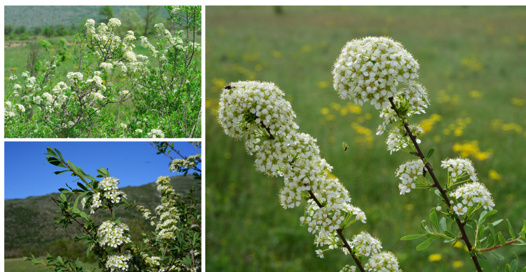
Figure 4. Spiraea hypericifolia subsp. hypericifolia (Abruzzo, Collelongo).

Conservation status: Spiraea hypericifolia currently occurs in Central Apennines in Abruzzo, in the L'Aquila basin, and in the Fucino plain. In the latter locality, the population is partly inside the NATURA 2000 network within the SAC IT7110205 "Parco Nazionale d'Abruzzo". The population in Umbria (Central Italy), confirmed by one old herbarium specimen, has not been observed for over 180 years. The Extent of Occurrence (EOO) is 231.104 km 2 , and the area of occupancy (AOO) is 24 km 2 (cell 2 × 2 km) calculated with GeoCAT (Geospatial Conservation Assessment Tool) software [23]. The species is present in two locations (six subpopulations), and a decline in the EOO and AOO was inferred, considering the possible extinction of the population in Umbria. A decline of the quality of habitat, due to the presence of the invasive alien Ailanthus altissima (Mill.) Swingle, was observed. According to IUCN [24] criterion B2ab(i,ii,iii,iv), the species is assessed as Endangered (EN) at the regional level (Italy).