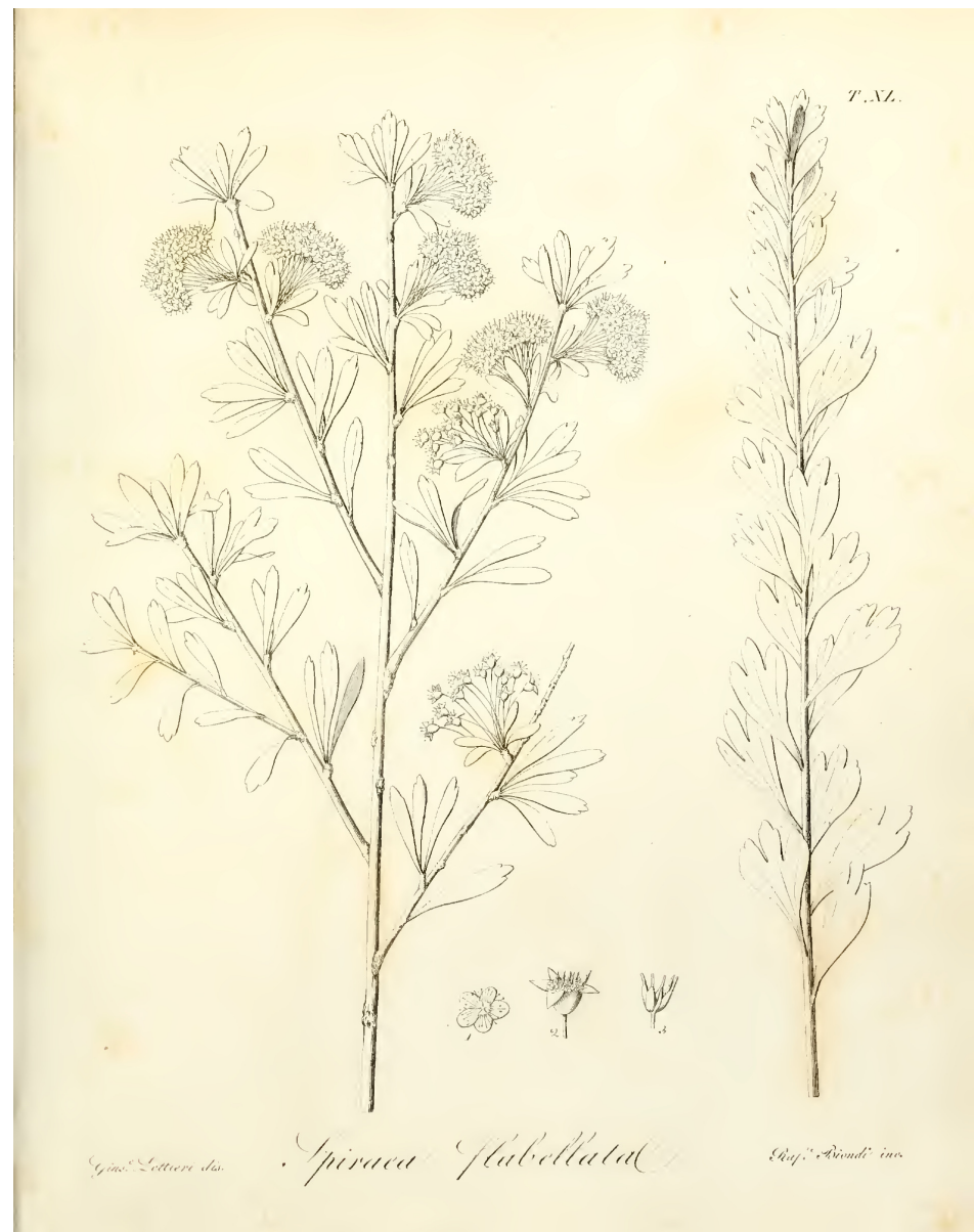
Figure 2. Illustration of S. flabellata cited in the protologue by Gussone as “t. 40”.