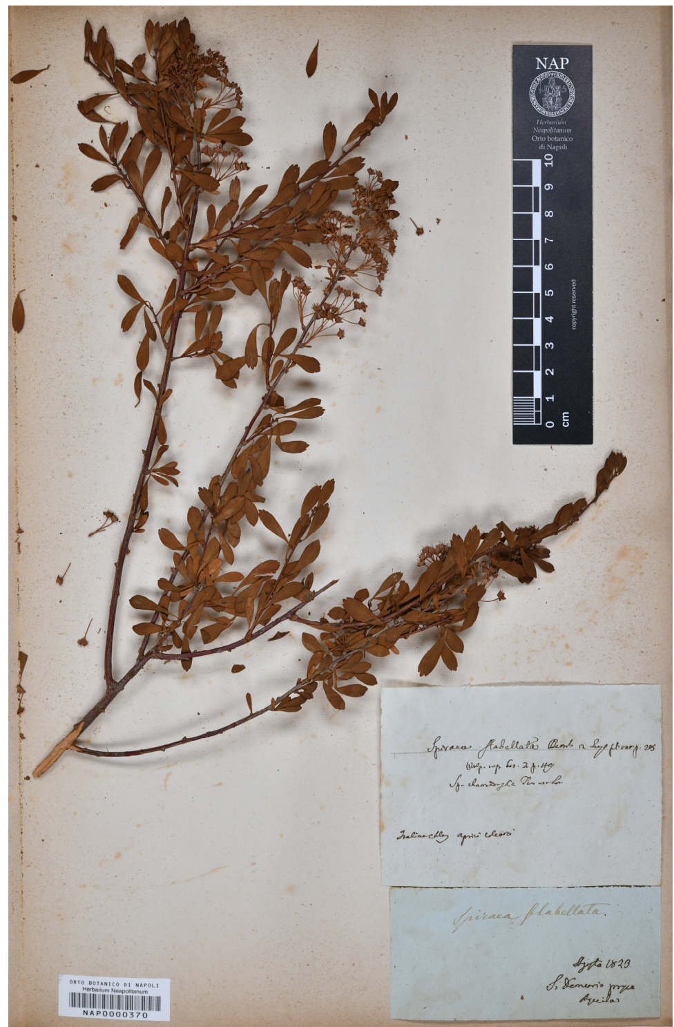
Figure 1. Lectotype of the name S. flabellata kept in NAP, barcode NAP0000370.