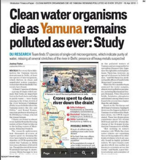
Fig. 5. Left panel: media attention following the organization of the International Symposium on Ciliate Biology, in 2018. Right panel: news on water pollution.

platform that was selected for this objective was Instagram; the account created for this purpose was “Microbialecolology”. The account has amassed over 120,000 followers from around the world within two years. On the account, various micrographs and videos of microscopic organisms ranging from protists to tardigrades are shared along with brief descriptions. In addition to imagery of microbes, photos and short videos from field sample collection and laboratory research are also featured. Instagram has been shown to be a powerful tool in sharing microbiology to an increasingly global audience (Hines and Warring 2019; Hines 2019b). Scientists should use this and other popular social media platforms (e.g. YouTube) to share their research beyond the traditional scientific outputs. The demographics for social media trend towards a younger audience (Hines 2019b), a key social target for sparking interest in sciences. An interesting observation made on “Microbialecolology” was the high number of followers from developing areas, who have vast interest in science but often lack access to research grade equipment many academics take for granted. Scientists and amateurs alike in any field can share their research on social media. The larger audience that can be reached, the larger the potential for inspiring further interest in science to an increasingly global community.