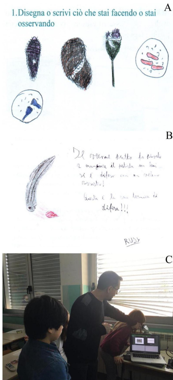
Fig. 4. (A) Drawing by an eight-year-old child of protists observed under the microscope. (B) Drawing and description made by an eleven-year-old child about the chemical defense response by a pigmented-toxic ciliate against a turbellarian flatworm. (C) Observation of protists in a fifth-grade class for biology teaching.

important biological phenomena in a school context. In addition, it can lead to the removal of common misconceptions which often identify unicellular organisms as inferior, less-evolved and/or invariably harmful (Fig. 4).