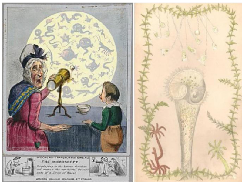
Fig. 1. Left panel: an illustration by William Spooner, ca. 1835, showing the horror of discovering the microscopic inhabitants of a drop of water. Right panel: an illustration from 'Edwin Lankester 1863 book, "Marvels of pond-life; or, A year's microscopic recreations among the polyps, infusoria, rotifers, water-bears and polyzoa", showing the beauty of aquatic microorganisms via an artistic composition of Stentor , Vorticella , algae and Hydra .