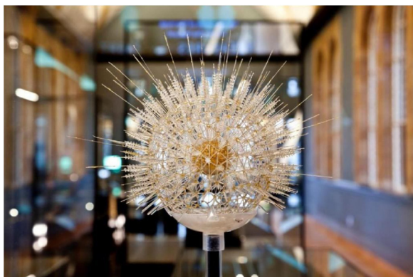
Fig. 2. Glass model of the phaeodorean Aulosphaera elegantissima Haeckel by Leopold and Rudolf Blaschka.

but invisible to the naked eye. To solve this, hands-on, interactive activities are ideal, where children and the public in general are directly responsible for the event's success. After a short briefing, they are fully in charge of handling harmless protists, microscopes, slides, and pipettes. They also learn how to identify protists by following simple identification keys. From young children to nonagenarians (and beyond!), people go "wow" when they look down a microscope and see living protists. Watching a multitude of bright green Euglena in a small drop of water, the delicate shape of the colonial diatom Asterionella , the cytoplasm of Metamoeba flowing into its large emergent pseudopodia, or the majestic pink of the ciliate Blepharisma catching small flagellates with its oral cilia, is all too exhilarating for them to witness (Fig. 3).