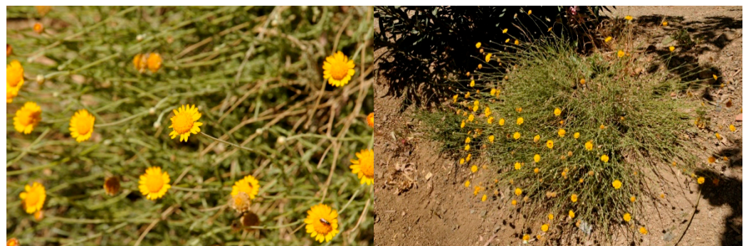
Figure 1. Cladanthus scariosus (Ball) Oberpr. & Vogt plants collected in Morocco.

C. scariosus (synonyms: Chamaemelum scariosum (Ball) Benedi; Ormenis scariosa (Ball) Litard & Maire, Basionym = Santolina scariosa Ball) is endemic to Morocco. It is a perennial plant with a strong aromatic odor, ranging from 30 to 60 cm in height; the stems are erect and ended by flower heads with orange-yellow ligules (Figure 1). This species is quite common in open areas on sandstone and is found in the Moroccan High Atlas [18].