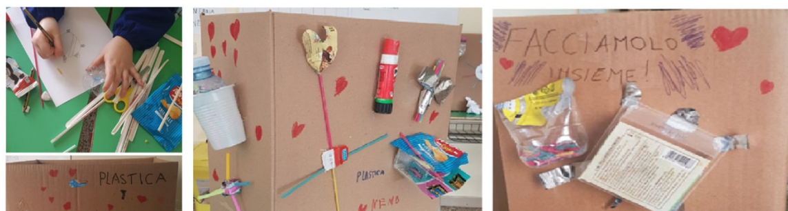
Figure 9. Operations of decoration of the differentiated waste collection by non-recyclable objects