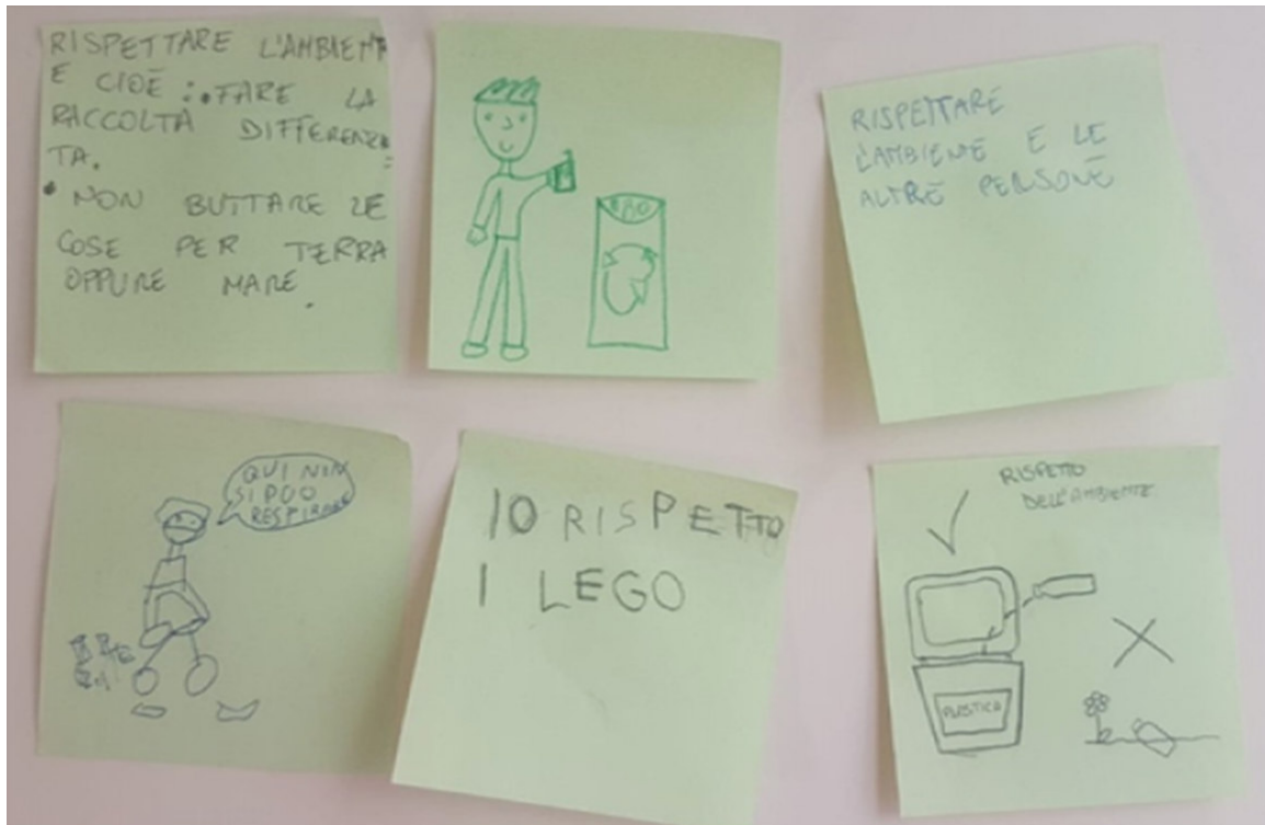
Figure 2. Some post-its on Respect and pollution