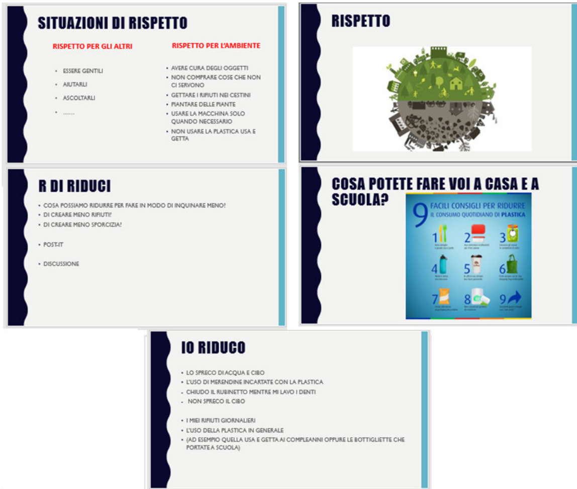
Figure 4. Powerpoint presentation of situation of Respect in correlation with Reduce with a few possible pieces of advice on good practices