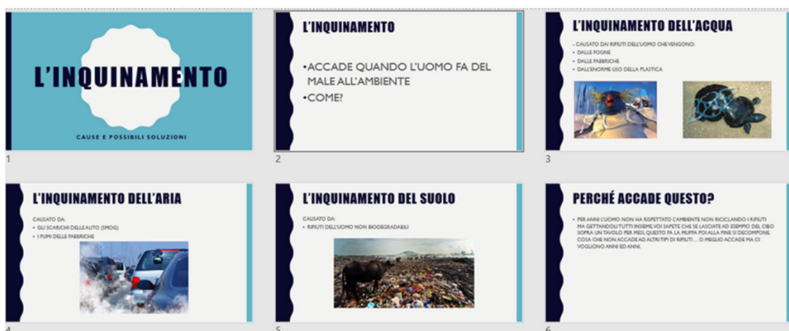
Figure 1. Powerpoint presentation of pollution (inquinamento) of water, air and soil, with final question about how this happens