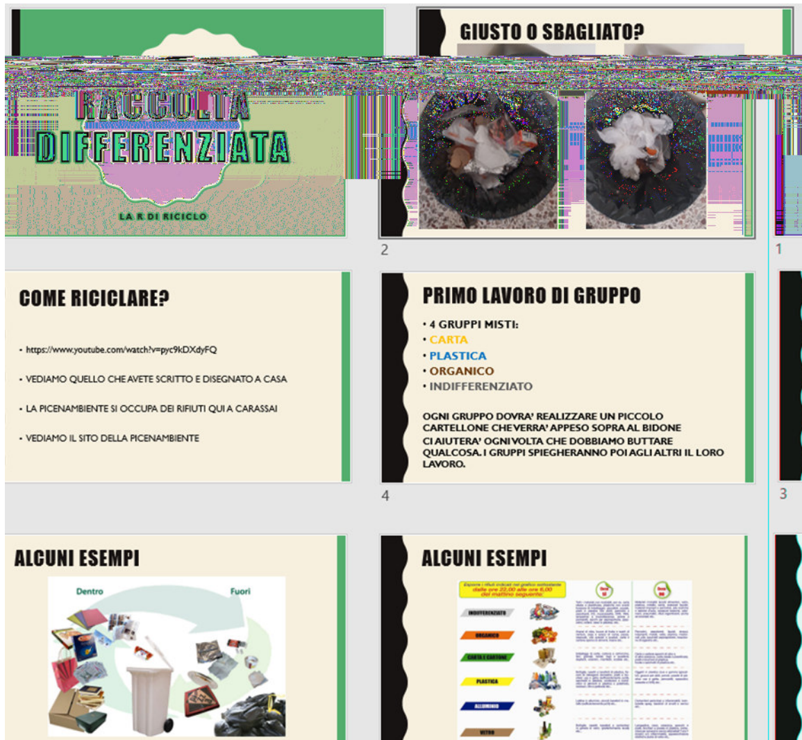
Figure 8. Powerpoint presentation of the local indications about differentiated waste collection and on the relevant work to be done at school