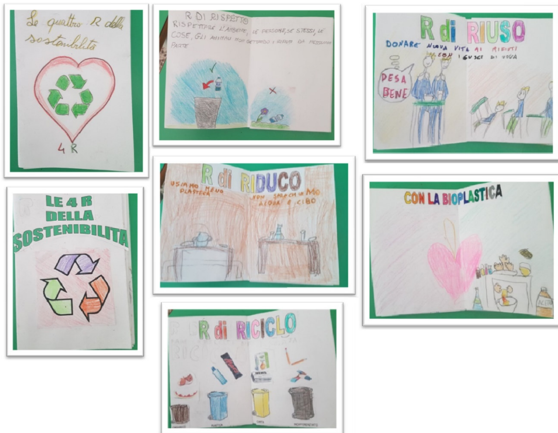
Figure 10. An example of booklet for the “authentic task” on the 4Rs