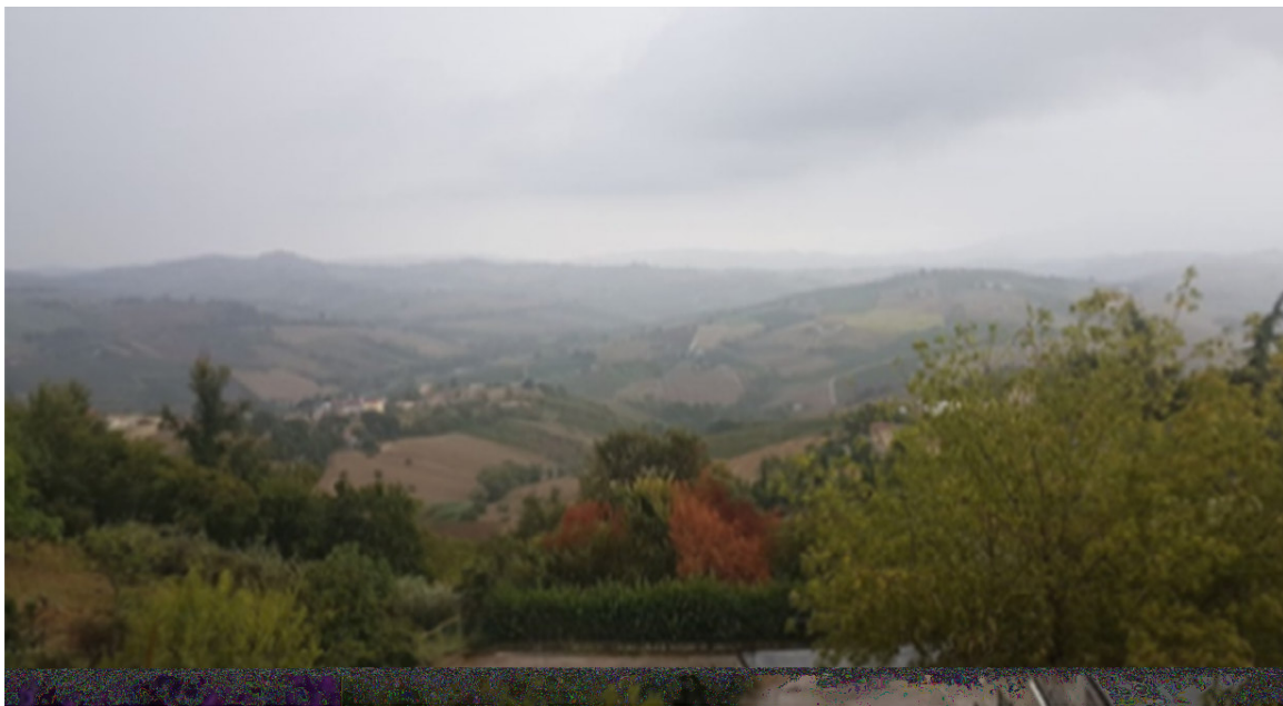
Figure 3. Landscape from the classroom window